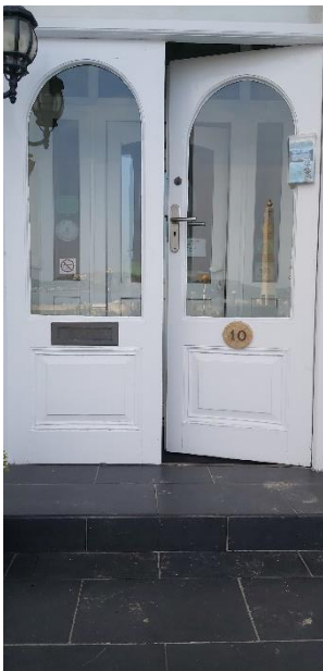
Front Double Doors