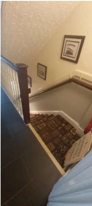
From Reception Hall