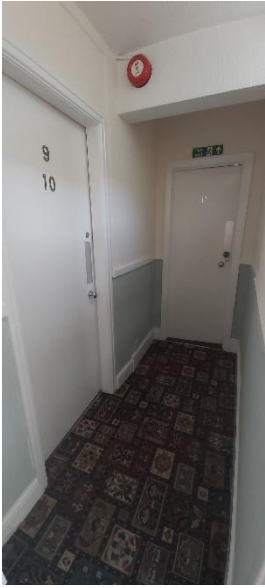
Rooms 9/10 , 11