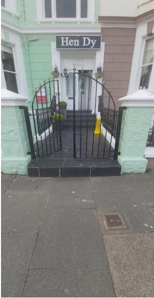
From North Parade