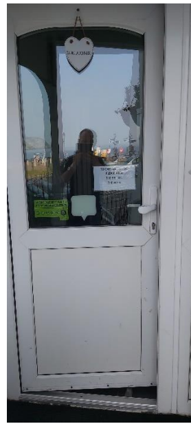
Self Closing Door