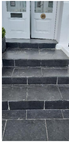
Steps to Front Door